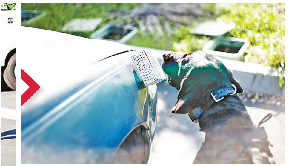
Riddick alerts at a box containing explosive dust (inert).

Officer Ed Dominguez releases Duchess off-leash to sweep an office (training exercise).