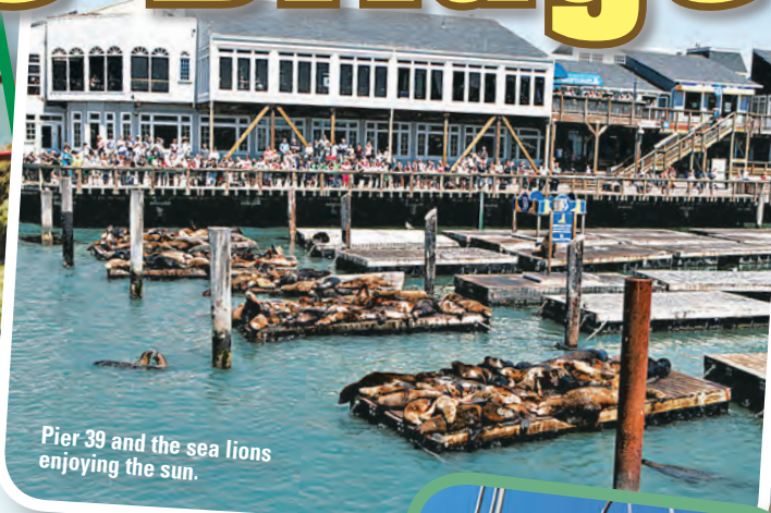
Pier 39 and the sea lions enjoying the sun.