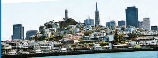
The San Francisco skyline from the harbor.

Directions: From Los Angeles, take the 5 north, then continue onto the I-580 west (signs for Tracy/ San Francisco). Keep right on the I-580 west (signs for Oakland/San Francisco), then keep left at the fork. Follow signs for I-80 W/San Francisco and merge onto I-80 west, then exit onto Fremont Street. Continue onto Front Street, turn left onto Pine Street. Turn right onto Franklin Street, then turn left onto Lombard Street. Continue onto US-101/Richardson Avenue, continuing to follow US 101.