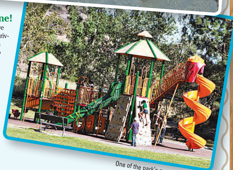
One of the park's many playgrounds.

If you are a bike enthusiast, you can ride the park's bike trail and continue out of the park to the nationally recognized Santa Ana River Trail, which extends some 20 miles to the Pacific Ocean. The park has lots of playgrounds and restrooms. There are also seven group picnic shelters (available by reservation), volleyball courts, horseshoes pits, a physical fitness course, two baseball diamonds and about 200 barbecues for your fresh catch of the day.