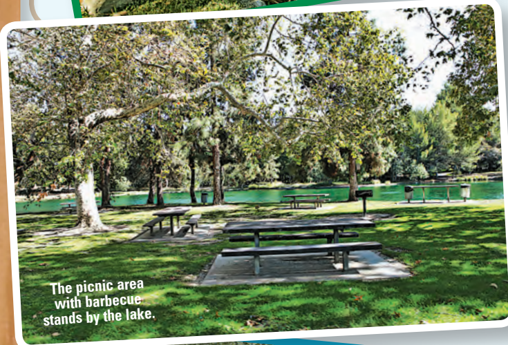
The picnic area with barbecue stands by the lake.