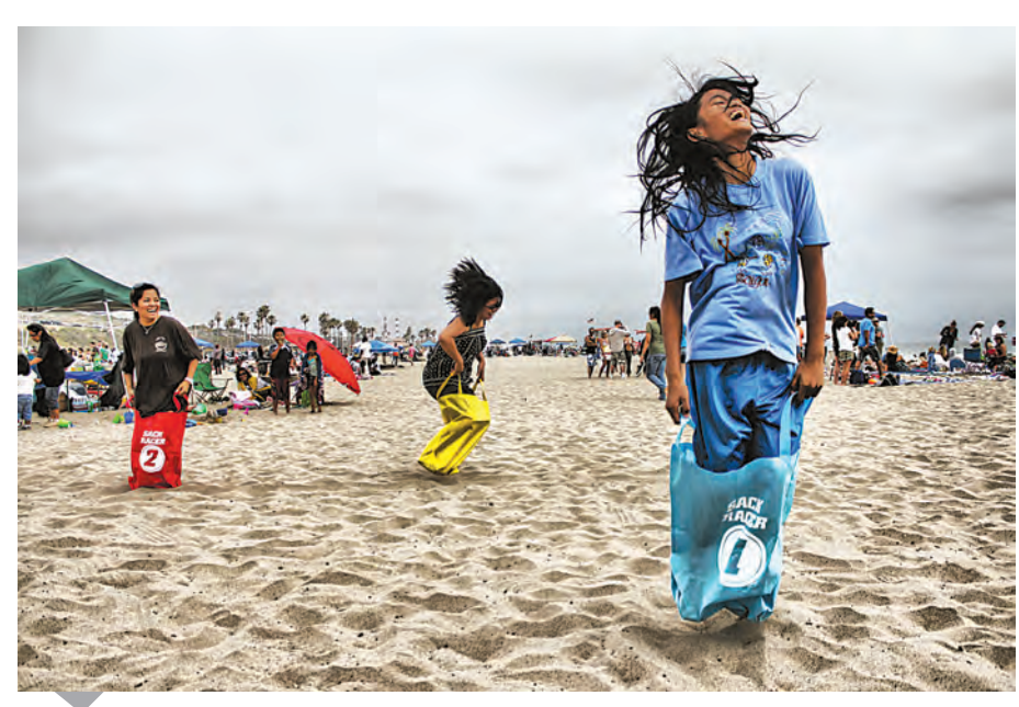
"Rush – gloomy sky, cold air and the rain repeatedly dropped in. Best day at the beach."

John's comment: Frankie, nice job getting everything visible despite the harsh lighting contrasts. A beautiful photo!