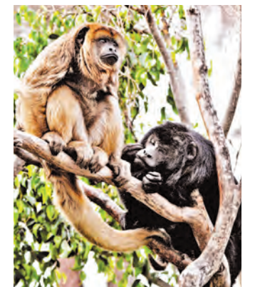
Female and male howler monkeys