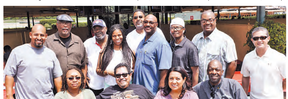
The attendees had fun.