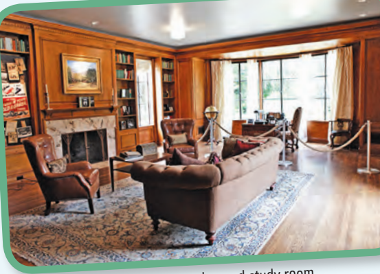
The Boddy House den and study room.