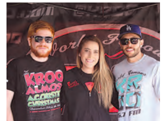
DJs from KROQ.