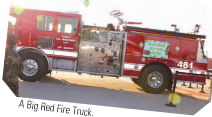
A Big Red Fire Truck.