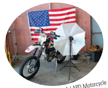
A LAPD motorcycle photo op.