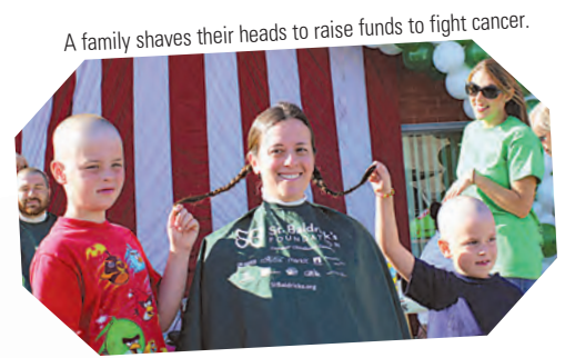
A family shaves their heads to raise funds to fight cancer.