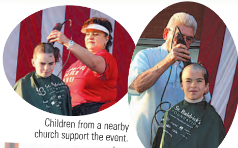
Children from a nearby church support the event.