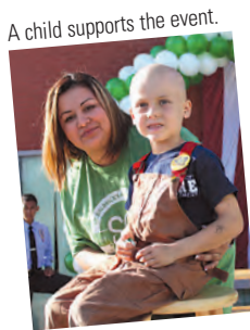
A child supports the event.