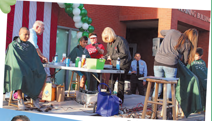
The head-shaving is under way!