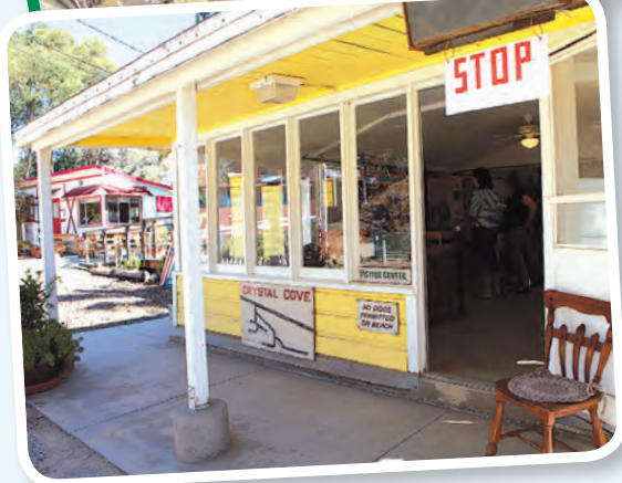
The Crystal Cove Visitor Center.

H ello everyone! Happy Spring! For this month's story we traveled to Newport Beach. I've taken you to this area in Crystal Cove before, but this time we will stay cool and walk along the beach. You can walk at least five miles or more if you really want to push yourself. This area is gorgeous, and there is much to do. You can walk along the upper bluffs, and also down on the sand, too. I looked around and found bikers, joggers and runners going by; I got so inspired that I am going to go back and jog the path myself. Amazing!