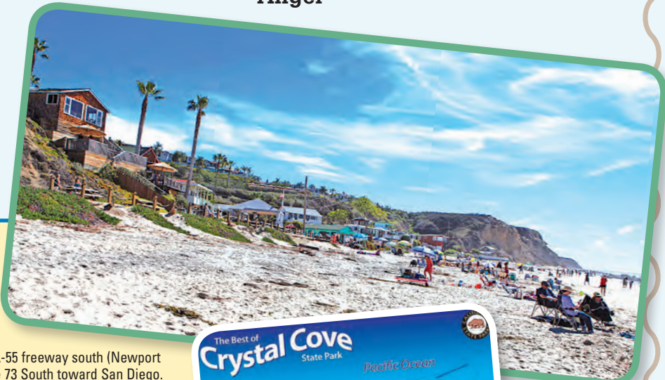
Beachgoers at Crystal Cove Cottages.