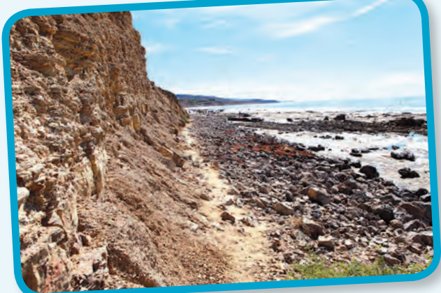
A trail along the beach.