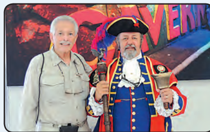
The welcome in Liverpool.

Greenock, the port, is 45 minutes from Glasgow. We had planned to take the train,