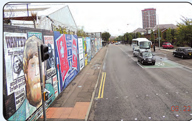
Belfast's dividing line.