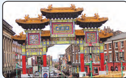
Chinatown in Liverpool.

but when we left the cruise terminal there were taxis that would take the four of us to Glasgow for £10 each (about $60 total). It was still a lot less than the $75 per person Princess wanted for their shuttle. The ride was pleasant and the countryside was very pretty. It was raining pretty hard when the taxi dropped us off at George Square at the city center. We found the Hop-On Hop-Off bus a short distance away. Because it was raining, we sat downstairs, but you don't see much from down there. As soon as it cleared I moved upstairs, where the view was better and it was a lot less stuffy.