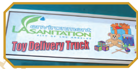
The toy delivery truck from West Valley Sanitation.