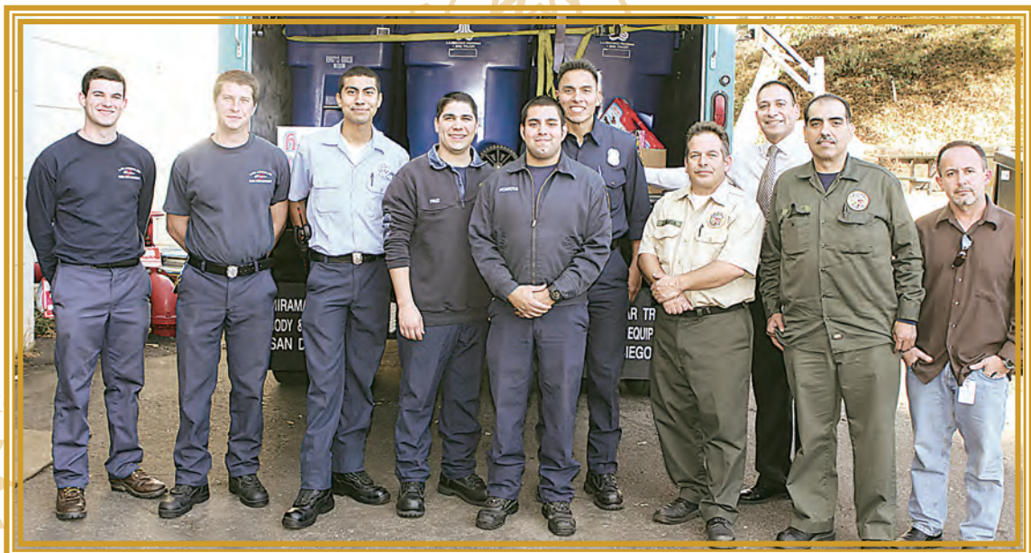
It was a dual effort from LAFD and Public Works/Sanitation to deliver toys that West Valley Sanitation Yard was able to contribute to the Spark of Love Toy program.