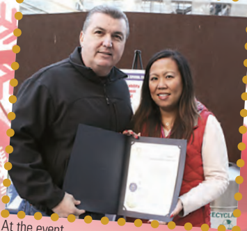
At the event.