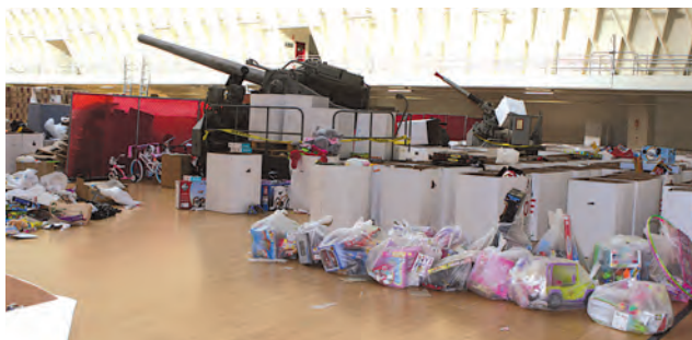
LAFD Training Center was used to store all the toys delivered from all parts of the City – minus the cannon behind the scenes.