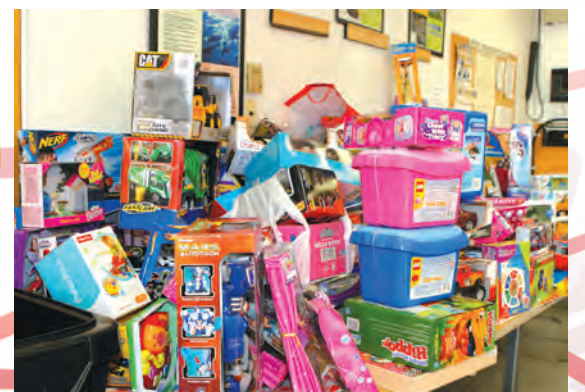
These toys eventually made their way to the LAFD Training Center for the Spark of Love toy drive.