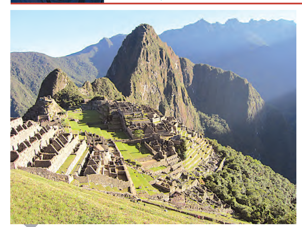
"I took a wonderful vacation to Peru with my family in July 2011, which included a visit to Machu Picchu. We got up at 4 a.m. so that we could arrive early and see the sun rise. This is my favorite picture. This was an adventure that was unforgettable!"