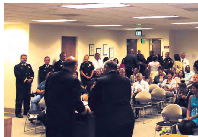
Awards ceremony attendees inside the Fire Commission Room, City Hall East.