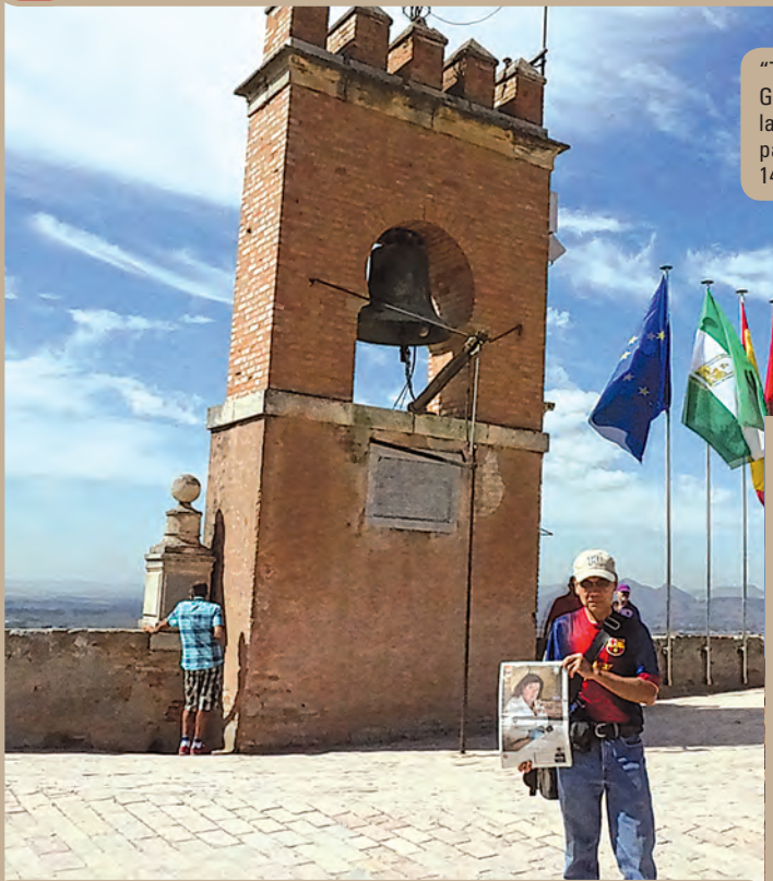
"The Alhambra (in Granada, Spain) was the last and greatest Moorish palace in the 13th and 14th centuries."