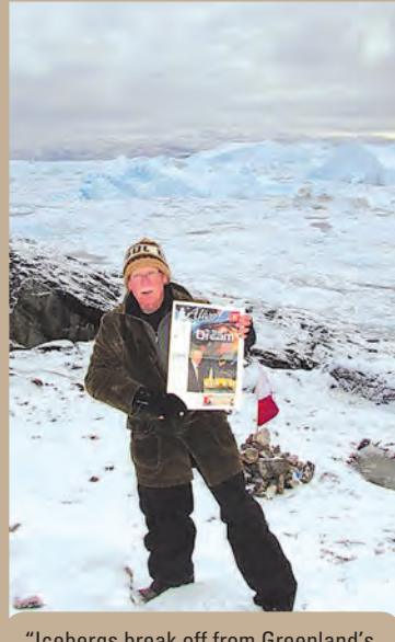
"Icebergs break off from Greenland's Sermeq Kujalleq glacier, the most productive glacier in the northern hemisphere, and migrate down the Ilulissat icefjord, a half-frozen tongue of the sea, enter Disko Bay, and eventually make their way to open ocean. The iceberg that doomed the Titanic originated from here."