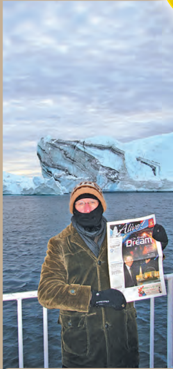
"Many of the icebergs in Disco Bay are small mountains."