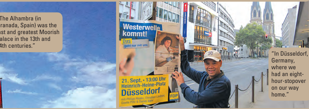
"In Düsseldorf, Germany, where we had an eight-hour stopover on our way home."