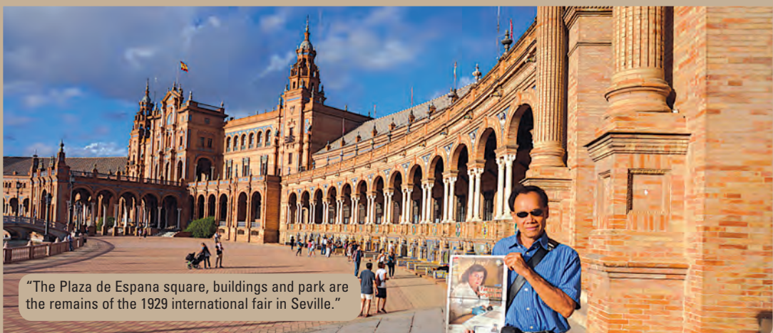
"The Plaza de Espana square, buildings and park are the remains of the 1929 international fair in Seville."