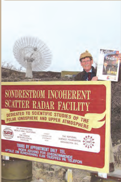
"Kellyville, Greenland, near Kangerlussuaq, advertises itself as an 'incoherent' community. The radio antenna of the Sondrestrom Incoherent Scatter Radar Facility probes the ionosphere in an attempt to understand better the mechanisms involved in the northern lights."