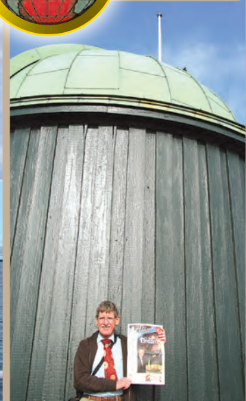
"The Rundetårn, in Copenhagen, is a 17th-century observatory tower that was used by Danish astronomers, including Ole Romer, who attempted to measure the speed of light. The green building here, at the summit of the tower, houses a telescope used today by amateur astronomers."