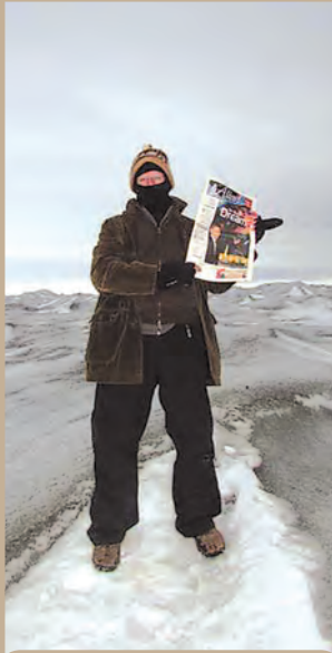
"Most of Greenland is covered with ice, and it's about 11,000 feet deep. It's uninhabitable, but you can reach it from the coast, which is clear of the ice cap and is where people live. Ice Cap Point 660 is a sea of frozen waves."