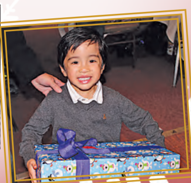
One of the many City Employee's children receiving a holiday gift.