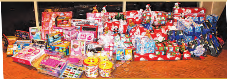
Gifts for children.