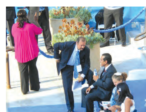
General Services crews hard at work during the inauguration ceremony.