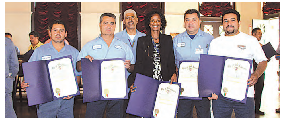
The crew from the Fleet Services body shop.