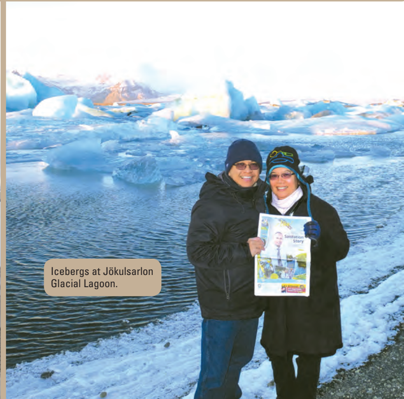
Icebergs at Jökulsárlón Glacial Lagoon.