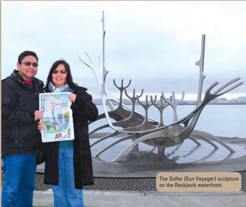
The Solfar (Sun Voyager) sculpture on the Reykjavik waterfront.