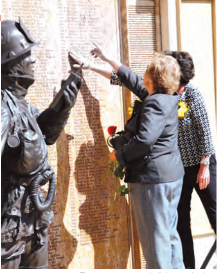
The names are read of those who lost their lives in the line of duty