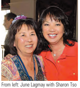
of the LA City Ethics Commission

38 December 2013 City Employees Club of Los Angeles • Alive!