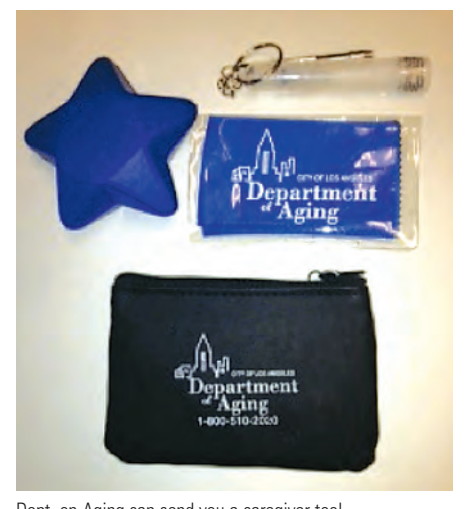
Dept. on Aging can send you a caregiver tool, while supplies last.

Family members caring for a loved one will receive a caregiver tool including: eveglass cleaner, stress ball or ID wallet, while supplies