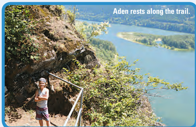
Aden rests along the trail.

Beacon Rock State Park is a 5,100-acre year-round camping park. The park includes 9,500 feet of freshwater shoreline on the Columbia River. We did not go far into the park, but we did hike up to the top of Beacon Rock. The mile-long trail