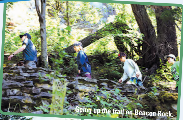
Going up the trail on Beacon Rock.