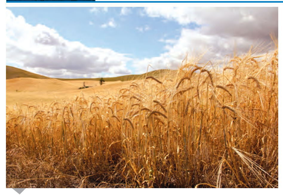
"Harvest time in a barley field in Cheney, Wash."