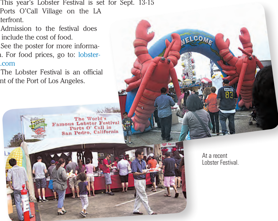
At a recent Lobster Festival.

The Lobster Festival is an official event of the Port of Los Angeles.