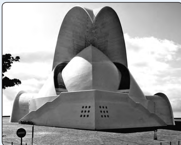
The Theater for Performing Arts in Casablanca.

The next day, we were scheduled to visit Cadiz, Spain, which will be covered next month.