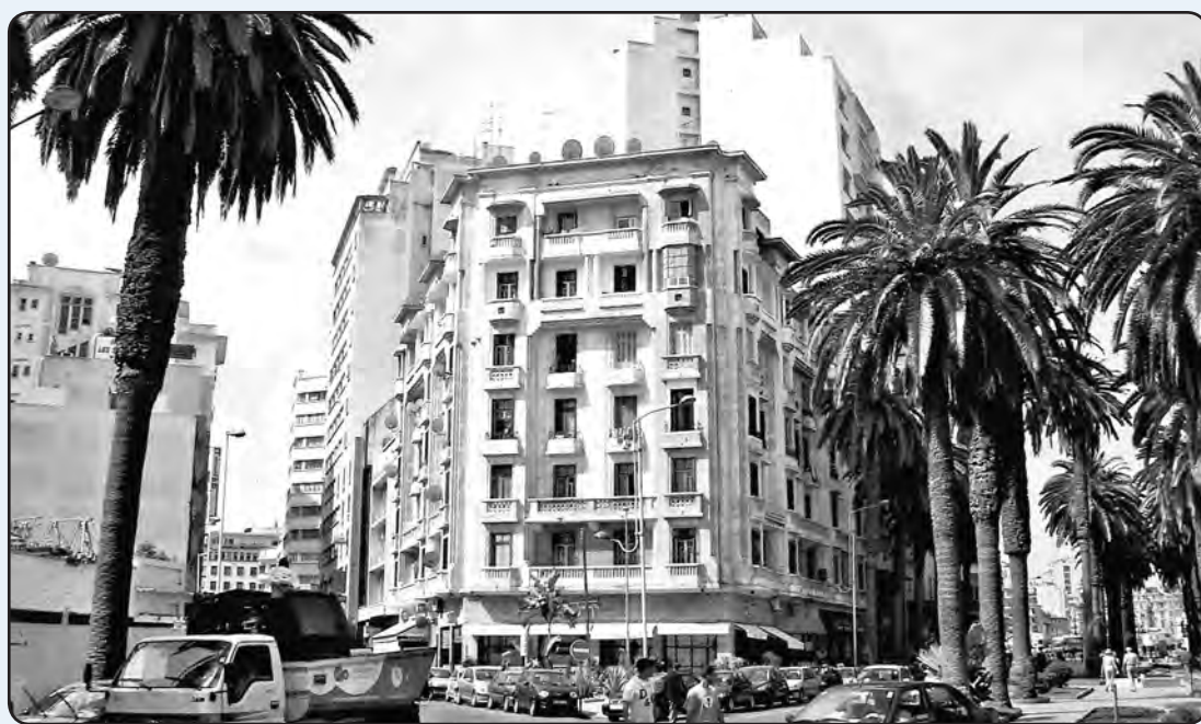
The city of Casablanca.

plate of canapé at the suite party. We then had dinner in the Bistro. I had a calzone, which was large enough to feed at least two people.