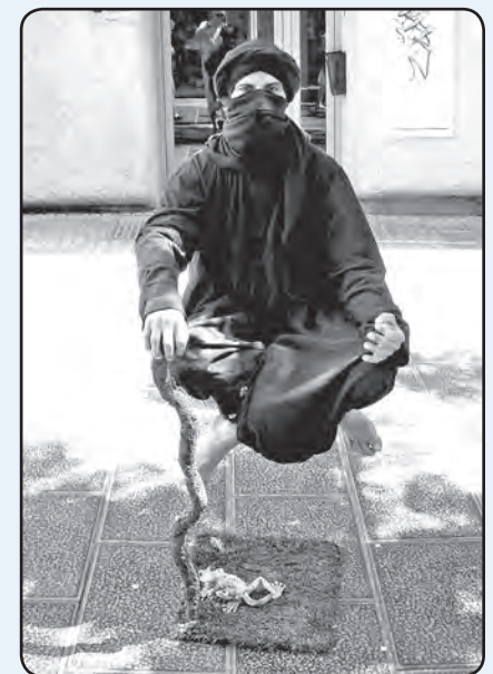
A street performer seems to be sitting in space.

We slept in, and it was nice. The seas were running pretty high, but the skies were clear and it was sunny and cooler than we had been experiencing. On that day there was a Sunday brunch, which the whole