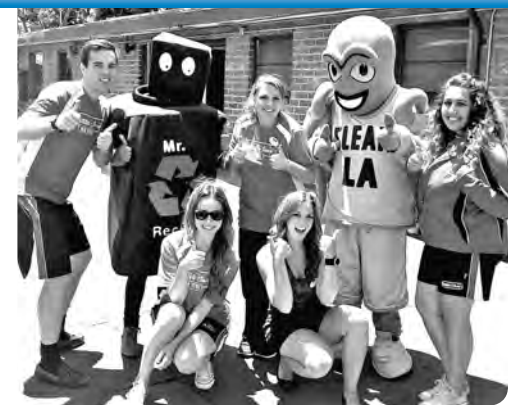
Radio Disney personnel pose with Sanitation's mascots.