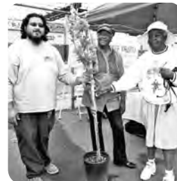
Free Trees volunteers and recipients.