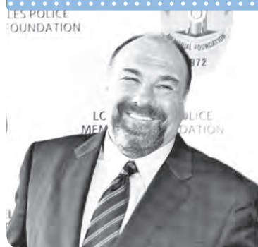
Celebrity host James Gandolfini of The Sopranos , who passed away not long after this event.

Is there something about insurance that you've always wanted to know, but were too ashamed to ask? Maybe something that you've just always been curious about? Feel free to send me an email at jgelineau@unitedagencies.com , and I will try to answer your question in one of our monthly columns.