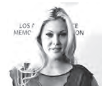
Actress/model Shanna Moakler.