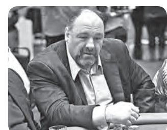
James Gandolfini hosted the event in one of his last public appearances before his untimely death.