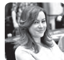
Actress Jennifer Tilly.