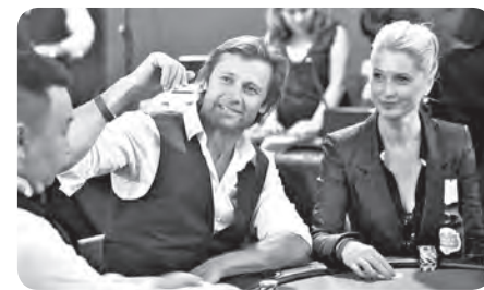
Actor Grant Show.