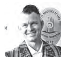
No Doubt drummer Adrian Young.