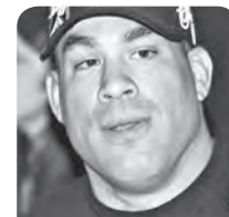
UFC fighter Tito Ortiz.