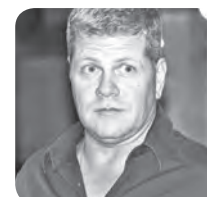
Actor Michael Cudlitz.