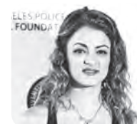
Golnesa "GG" Gharachedaghi from The Shahs of Sunset .