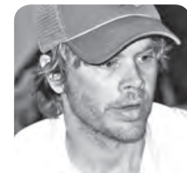
NCIS LA actor Eric Christian Olsen.