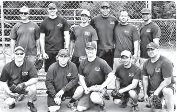
Fire Station 46.