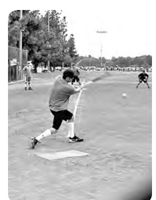
Really going for it!