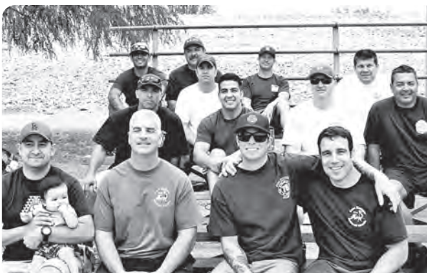
Fire Station 78.