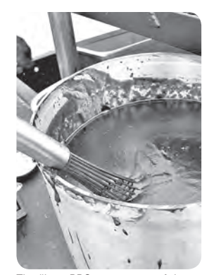
The "best BBQ sauce west of the