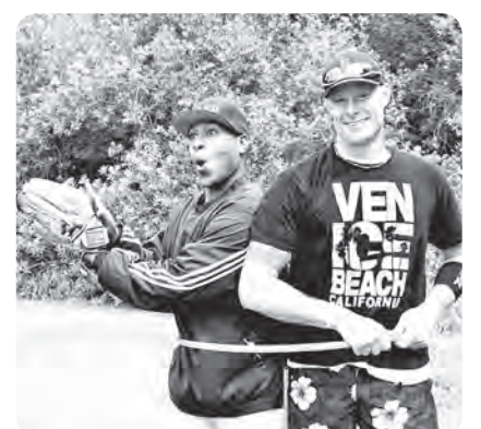
Fire Station 67 has fun.