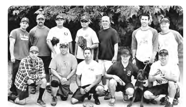
Fire Station 20.