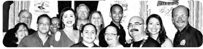
The Port Police's Baker to Vegas support staff!