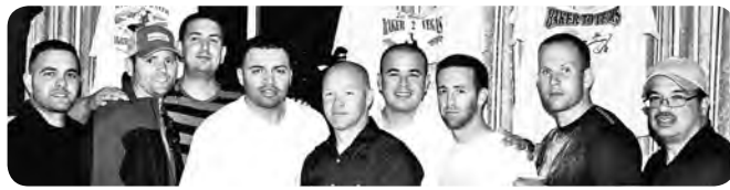
The Port Police's Baker to Vegas runners!