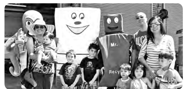
Residents take photos with Recycle Robot and his friends

Sanitation hosts its annual yard open houses, focusing on recycling.