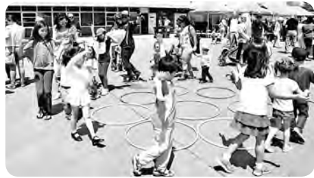
The Radio Disney kids at the West Valley open house.