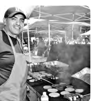
Club Member, cooks hot dogs and ham-