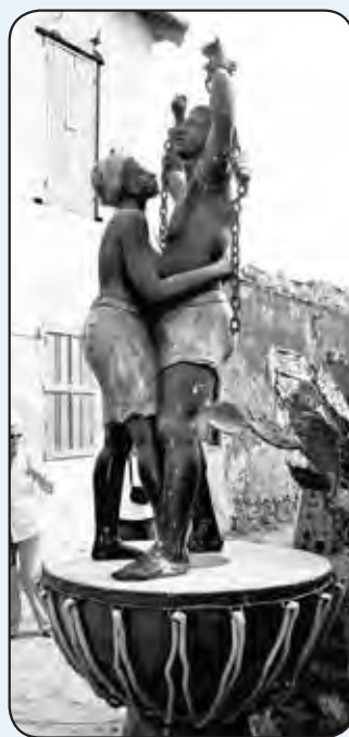
A statue honoring slaves who left from the island.

was heartbreaking to see the conditions that the people were forced to endure and the inhuman treatment. The door of no return was the last time most would ever see Africa. This door led directly to a seawall, and you either got on the ship or were pushed into