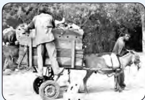
It was trash pickup day.

We then returned to the slave house (the current one was built in 1776) for our tour. It