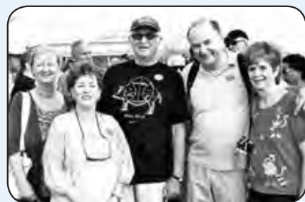
Our trivia team waits for the ferry to Ile de Goree.