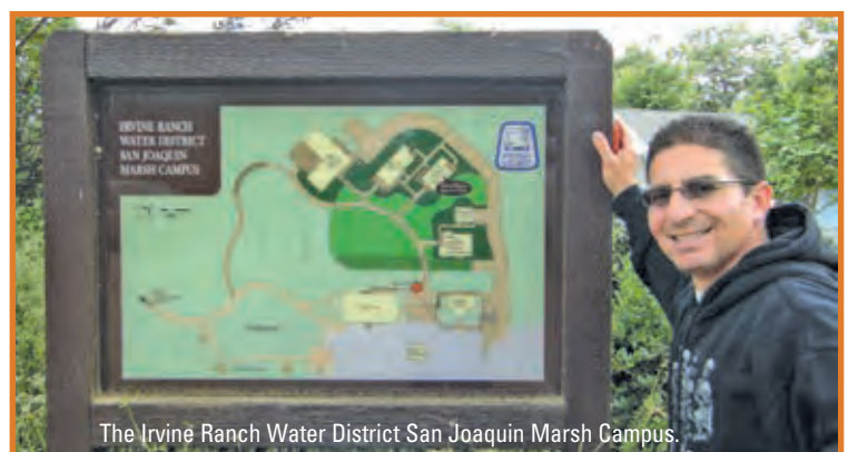
The Irvine Ranch Water District San Joaquin Marsh Campus.