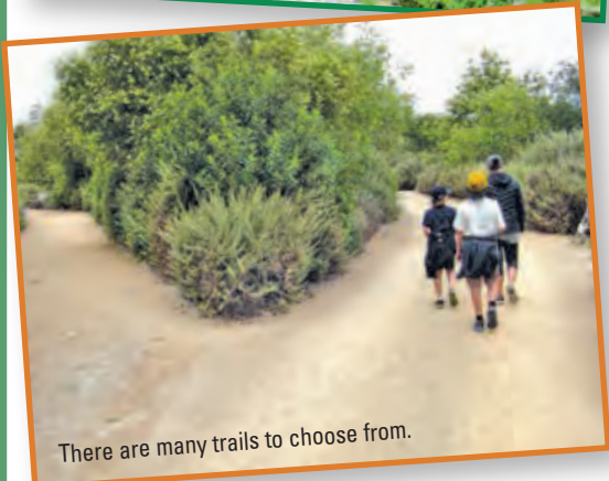
There are many trails to choose from.