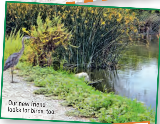
Our new friend looks for birds, too.