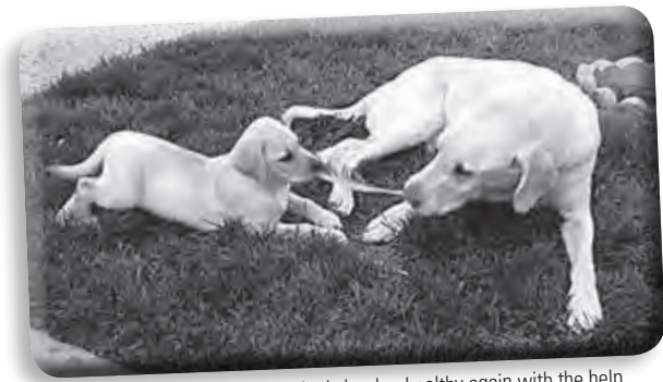
Brady the Labrador, healthy again with the help of the Club's pet insurance product.

I signed up my three four-legged kids (two male Labs and a female cat) with the Club's pet insurance to provide coverage in case of an accident, and am I ever glad I did. I was pleasantly surprised when I submitted the forms for the shots and dental cleaning, and I received a reimbursement check rather quickly. Then about four months after I purchased your plan, my seven-year-old Labrador tore his ligaments running around the swimming pool (I am always shouting out, "No running around the pool – leave your sister alone!"), trying to fetch his "cat." The pet insurance