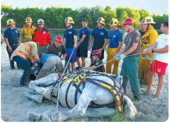
From August 2012: A horse is rescued.