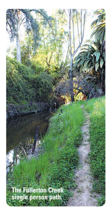
Aden with the Body Circle Rings.

deuvideo in the Seneral area. Il you inte,