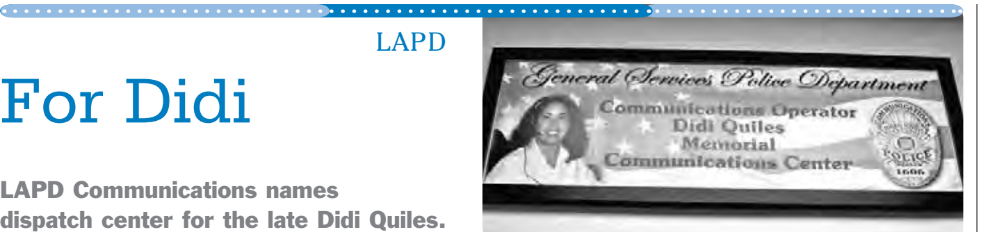
The framed remembrance hangs over the entrance to the dispatch center