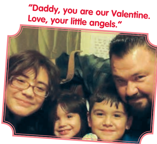
"Daddy, you are our Valentine. Love, your little angels."