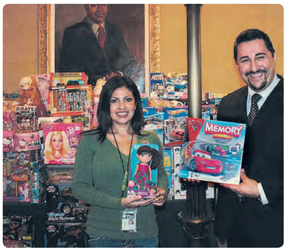
The Club delivers part of its collection of toys to LACECA representatives. The Club also distributed toys through the LAPD

We'll see you all next year with the next Club Toy Drive.