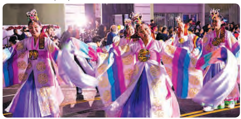
Pacific American volunteers