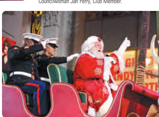
Santa made an appearance.