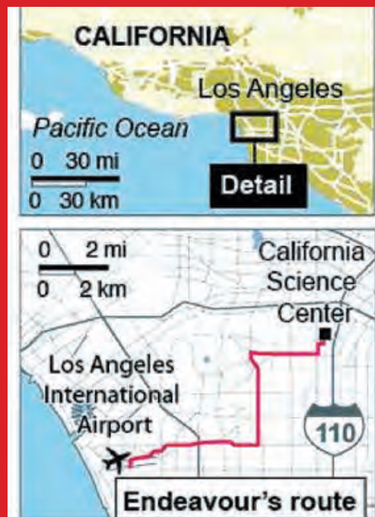
Endeavour travelled 12 miles in 2 days to reach the California Science Center, its new home.