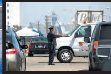
An Airport Police Officer directs traffic around LAX to ensure everything runs smoothly.