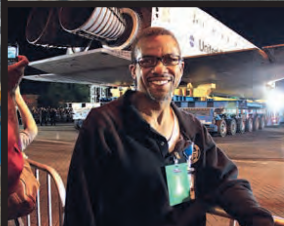
A Public Works employee monitors the Endeavour's progress.