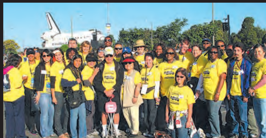
Members of LAX's volunteer Team LAWA and friends who assisted the City of Inglewood during the Endeavour's stopover in that city.