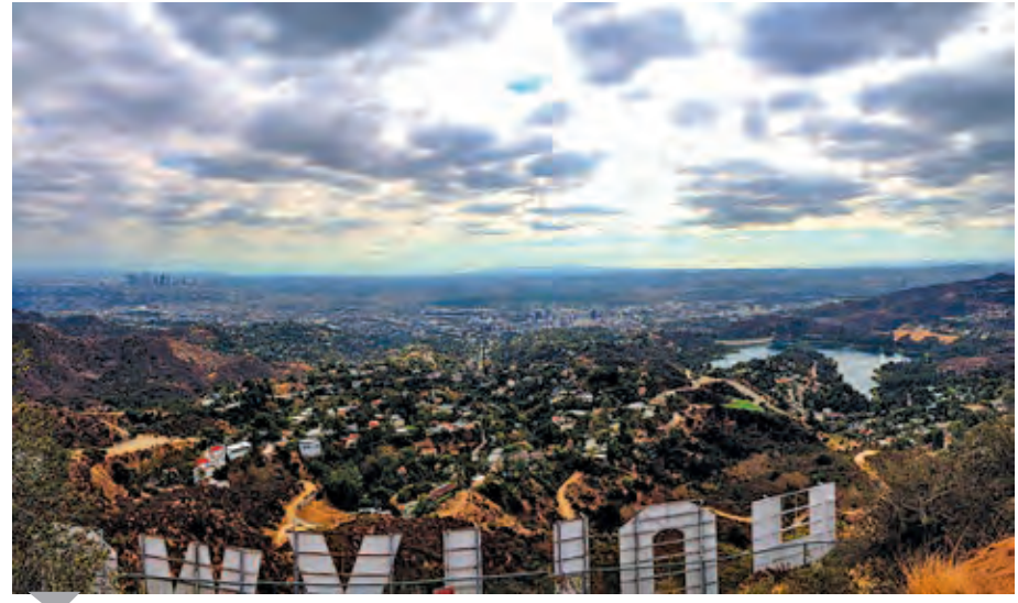
"The view from atop Mt. Lee looking south with downtown L.A. to the left and the Hollywood Reservoir to the right."