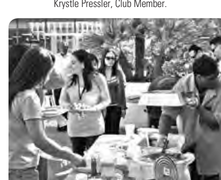
Lunch is served!