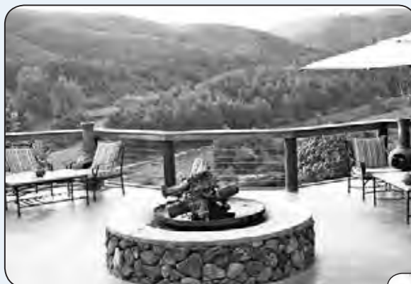
A view from the lodge.

We waited in the Virgin Atlantic lounge until our flight to Johannesburg. The lounge was very comfortable and the service was outstanding. We had about a three-hour wait until our next flight.