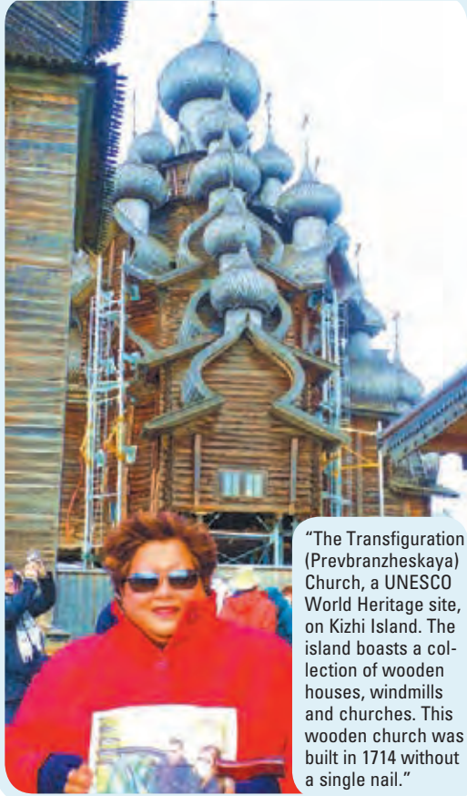
"The Transfiguration (Prevbranzheskaya) Church, a UNESCO World Heritage site, on Kizhi Island. The island boasts a collection of wooden houses, windmills and churches. This wooden church was built in 1714 without a single nail."