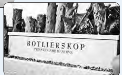
The game reserve.

lounge so I skipped dinner and had just a drink and cheese plate. I watched a movie, and at about 11:30 p.m. I had them make up the bed. The seat flipped over and, with the "footstool" extended, laid flat. The "bed" was about seven feet long. They put a pad