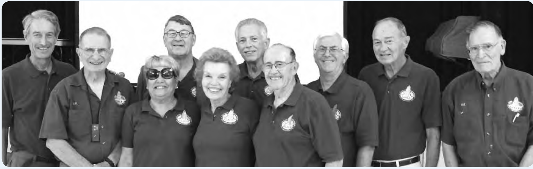
The RLACEI Board of Directors.