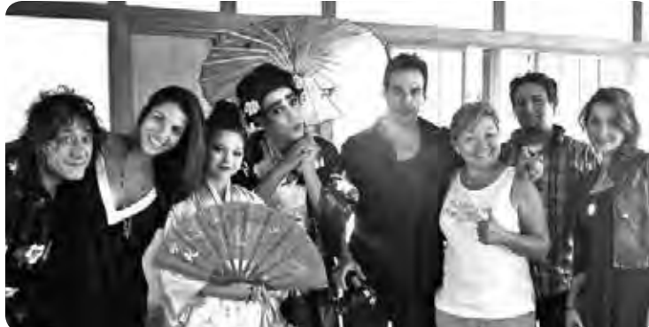
L.A. CityWorks Crew taping at the Tillman Water Reclamation Plant's Japanese Garden.