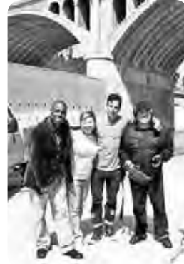
Taping on the L.A. River.