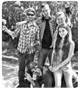
The crew from L.A. City Works at Barnsdall Art Park.

http://parc1.lacity.org/appldept/calendarME/filedocs/ita/tvguide.cfm