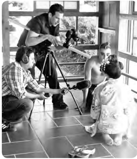
L.A. City Works tapes at Tillman Water Reclamation Plant's Japanese Garden.