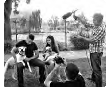
Taping pets at Barnsdall Art Park.