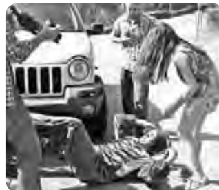
Taping an action sequence at Barnsdall Art Park.