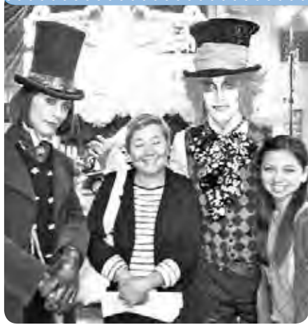
L.A. City Works tapes on Hollywood Boulevard.