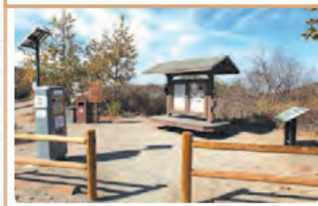
A rest area, the parking meter kiosk, and area information.