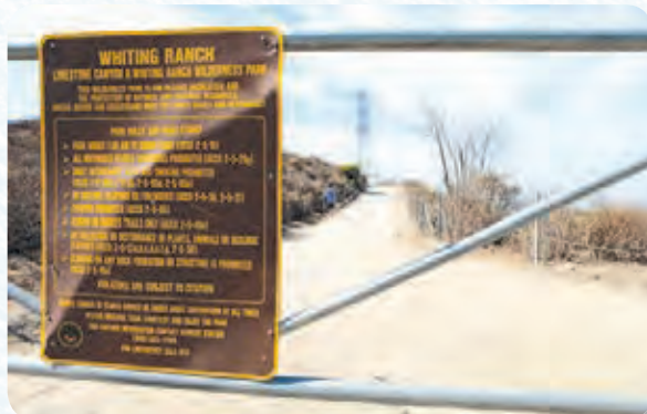
The front gate at Whiting Ranch.