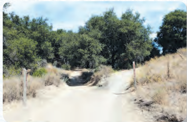
There are multiple paths to choose from.