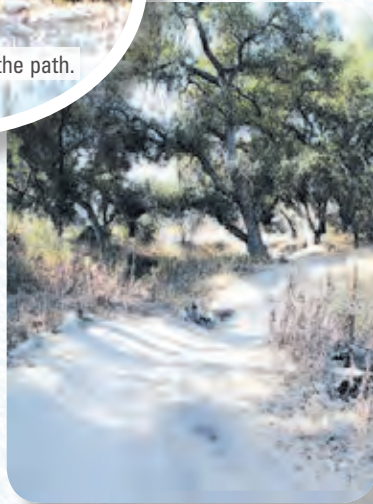
Look closely and notice the mountain biker tire prints.