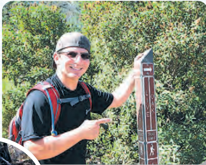
This Live Oak trail sign shows the way.