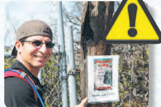
Mountain lion warnings in the area.