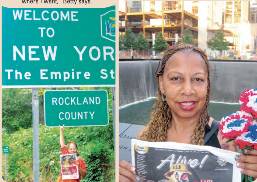
"Visiting the 911 Memorial in New York."