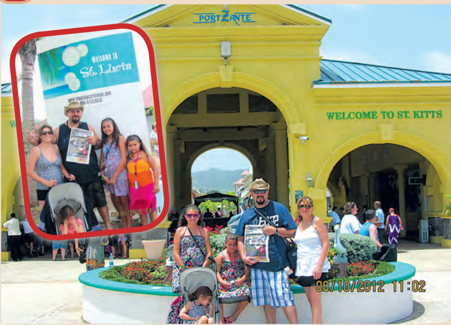
"I'm here on the islands of St. Kitts and St. Lucia, two of the six islands that we visited on a cruise family vacation."