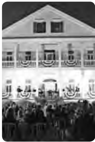
From last year's birthday concert.