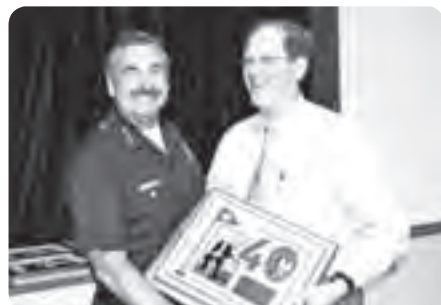
Chief Charlie Beck presented an award for first place, 2011 (under 100 personnel), to Criminal Gangs and Homicide Division.