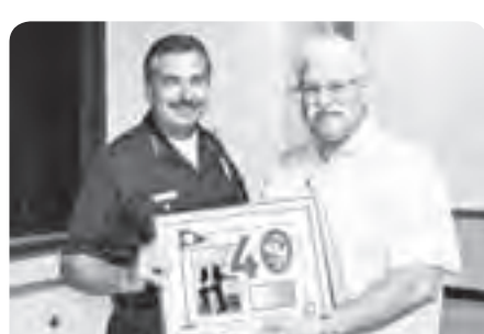
Chief Charlie Beck presented an award for third place, 2011 (under 100 personnel), to Special Operations Division.