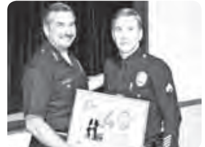
Chief Charlie Beck presented an award for first place, 2011 (more than 100 personnel) to Newton Division.