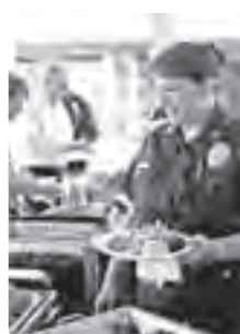
BBQ beef, chicken, beans and salad were served.