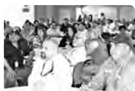
Harbor's "perfect" employees ready themselves for the awards and prizes.