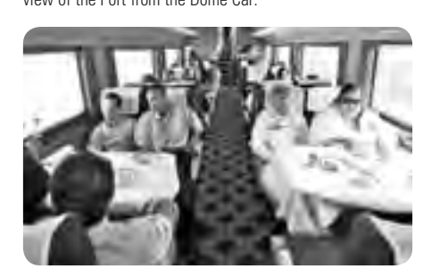
Harhor employees relax in a Zephyr dining car.