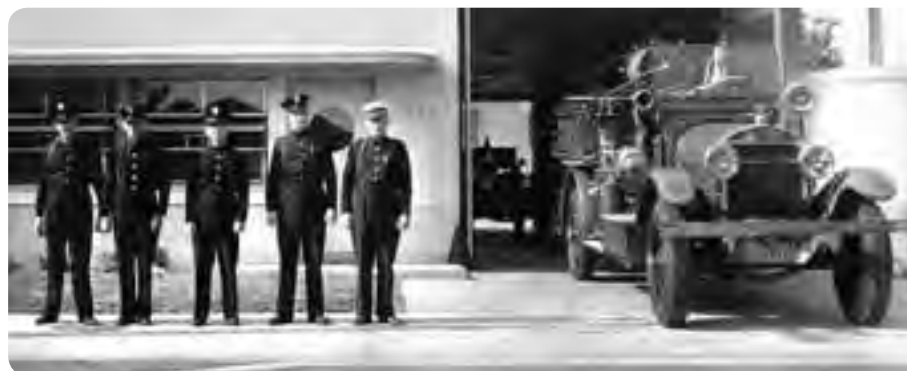
The former Fire Station 21 in August 1942, nearly a year after opening.

The Fire Station was funded through Proposition F funds.