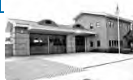
The new Fire Station 21.

Fire Dept. opens Fire Station 21 in South L.A.