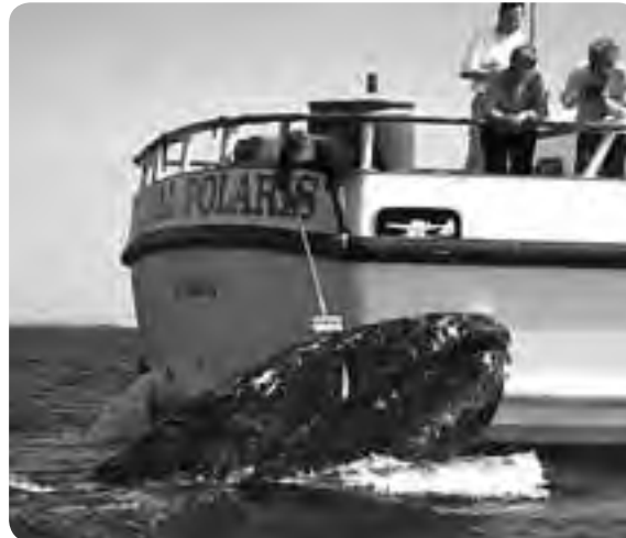
Seeing whales up close is a strong feature of the Baja whale-watching trip.

The Aquarium is a Rec and Parks facility and is at 3720 Stephen M. White Dr. in San Pedro.