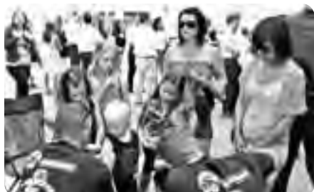
Even the kids want an LAFD tattoo, provided by Fire Station 2.