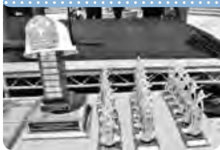
Team awards and the grand trophy are displayed.