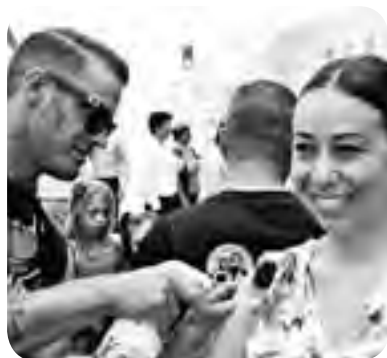
Another happy customer gets an LAFD tattoo!