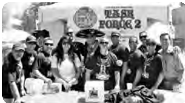
Fire Station 2 serves up delicious carmitas soft tacos for a great cause!