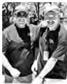
The Fire Prevention Bureau keeps the crowd happy with churros.