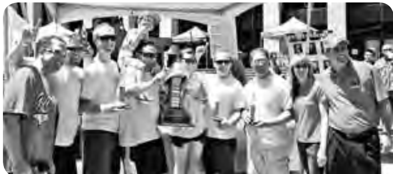
Team Muir-Chase Plumbing took the first-place trophy. The MPG Office Trust came in second, and Able Engineering came in third. Way to go!