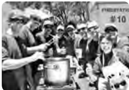
Fire Station 10 teams up to make barbecued pork sandwiches.