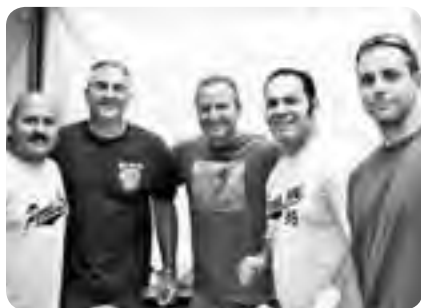
Personnel from Fire Station 98 cook up shrimp at the Shrimp Shack.