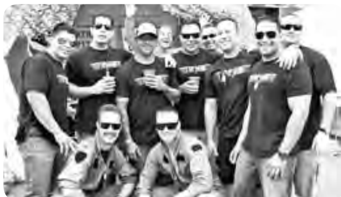
Fire Station 12 – "Top Gun" theme and winners of the best dessert – deep fried Oreos!