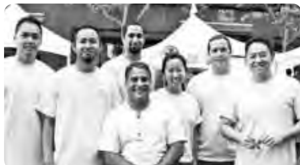
Team BNY Mellon competes to hold on to last year's first-place win!