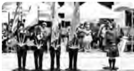
The Color Guard and bagpipers started off the ceremony and festivities.