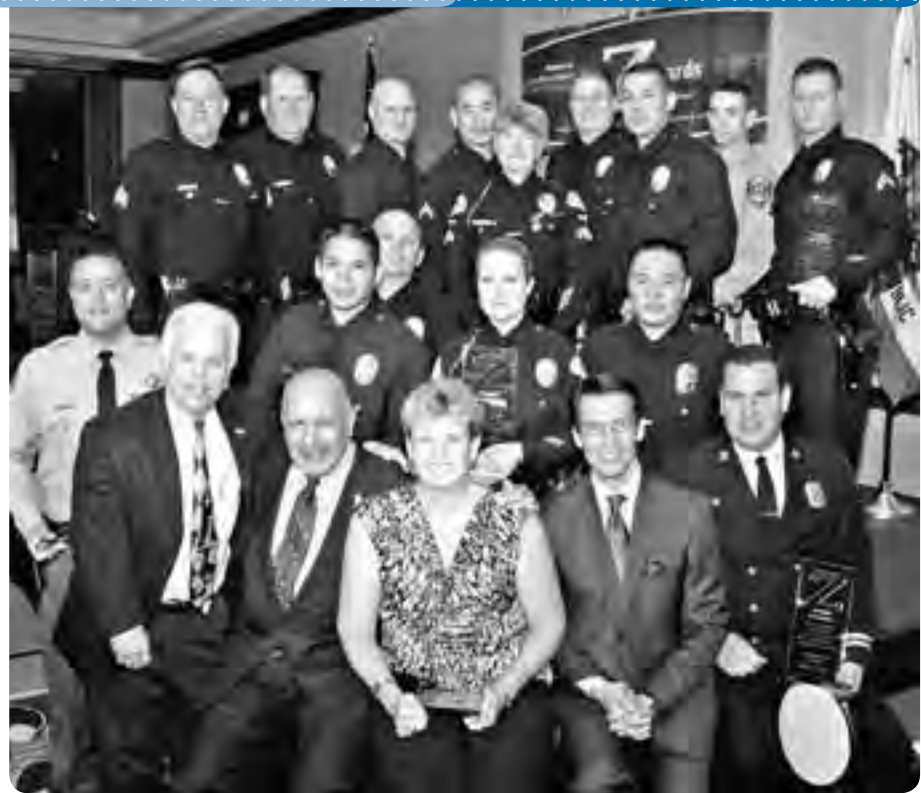
The awardees gather together at the 10th annual Z Awards for ExZellece May 24.