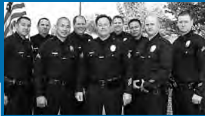
Topanga Organized Retail Crimes Unit LAPD Topanga Area